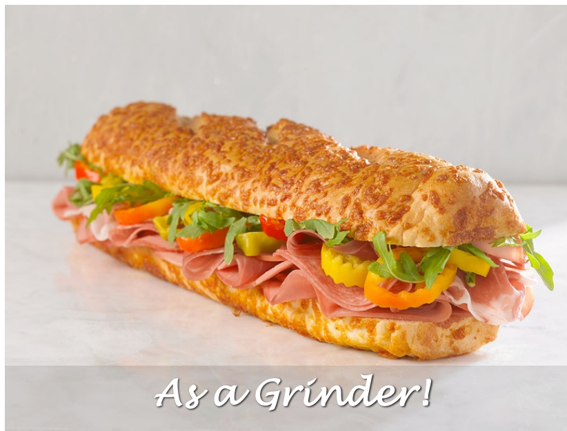
As a Grinder!