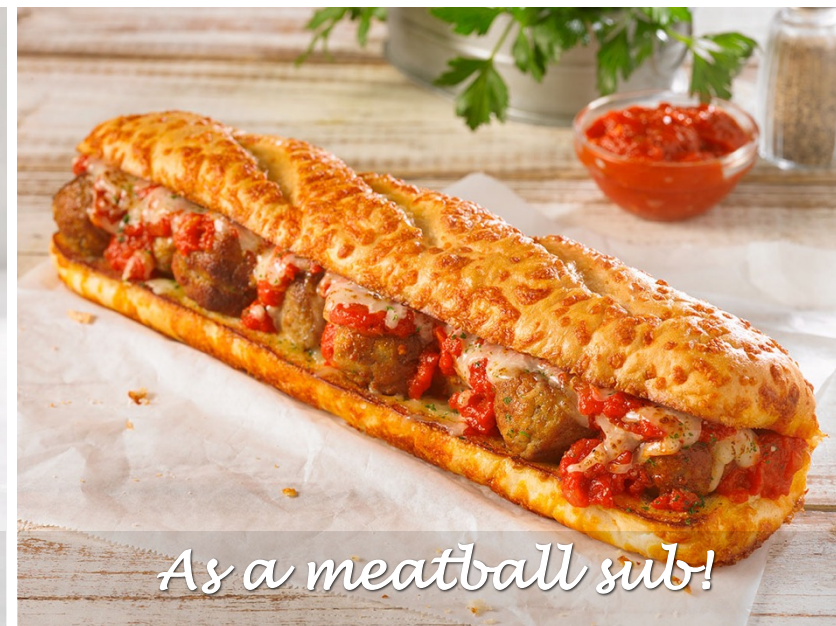
As a meatball sub!

12" Four Cheese Hoagie Code: #11149 | 6-4ct Case Pack