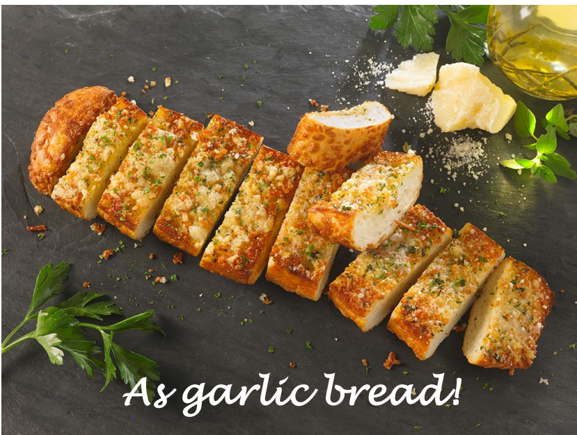
As garlic bread!

Check out the versatility of our cheese bread